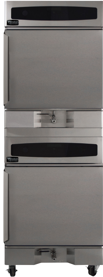
Model Shown: RTV5-05UV Stacked

The CVap RTV is the fastest cooking CVap Oven currently available. Some call it a "Poor Man's Combi." We don't want to BS you though... it isn't a combi. Yep, it can cook with sous vide precision, or bake, or braise, or roast, or poach, or low-temp steam... AND it does other things a convection oven only dreams about. But, it isn't going to roast 758 chickens in 4 minutes, 33 seconds. It also isn't going to make you refinance your house to buy one or pay for repairs. We've got volumes of science and data to back us up, but only so much space here. If you want to learn more, go to our website, www.winstonfoodservice.com , and geek out with us.