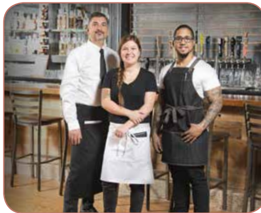
Models (L to R): 6' / 5' 3" / 5' 7"

INDIVIDUALLY PACKAGED IN PRINTED POLY-BAG