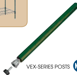
VEX-SERIES POSTS NSF

Customize the Epoxy Coated Wire Shelves to accommodate all of your storage needs