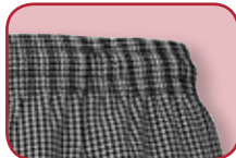
Elastic waistband, inner drawstring