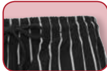
Elastic drawstring waist