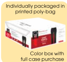
Individually packaged in printed poly-bag