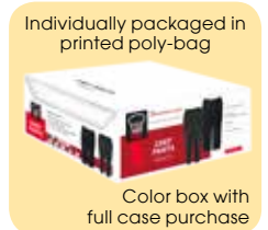
Individually packaged in printed poly-bag