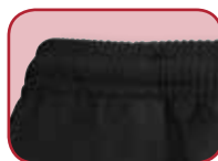
Elastic drawstring waist