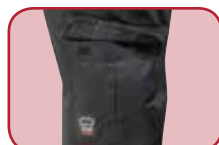
Cargo pockets with velcro closure