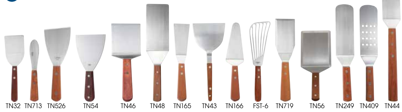
Relative size comparisons shown