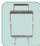
TCT-750B 3/4" wide cuts