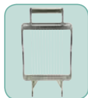
TCT-375B 3/8" wide cuts