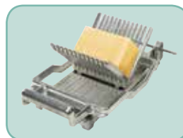
Uniformly slice cheese blocks