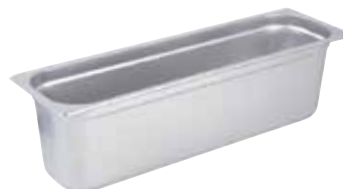
SPJH/SPJL-SERIES HALF LONG STEAM PANS