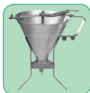
SF-7 & SF-7R