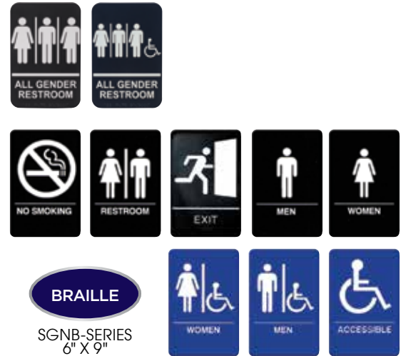
SGNB-SERIES 6" X 9"