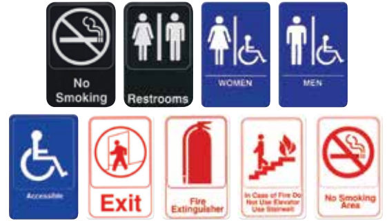
SGN-SERIES 6" X 9"