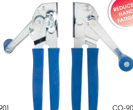
CO-901 Front gears Back handle CO-902