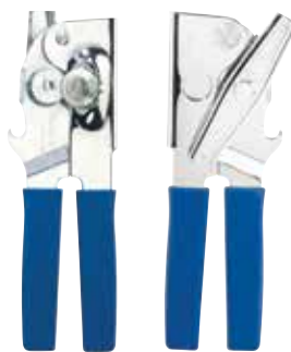
Front gears Back handle