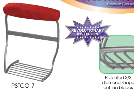
Patented S/S diamond shape cutting blades