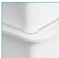
Seamless fit for fresh storage