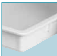
Reinforced edges & corners