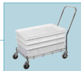
Transport dough boxes