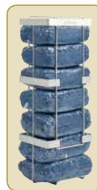
Dispenser holds 7 brick packs