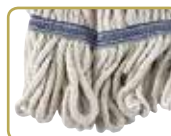
Looped ends prevent unraveling