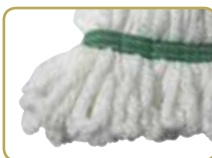
Looped ends prevent unraveling