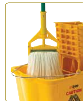
MOPM-M shown with MOPH-7P handle and MPB-36 mop bucket