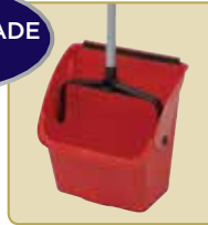
Jumbo upright dust pan