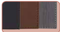
Full size menu cover styles available in 3 colors