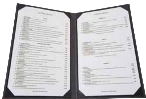
LMD-814BK Two-view Legal size