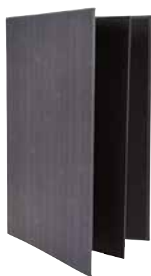
LMF-814GY Four-view Legal size