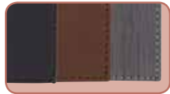
Full size menu cover styles available in 3 colors