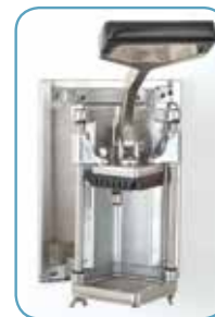
Wall mounted with HFC-BK