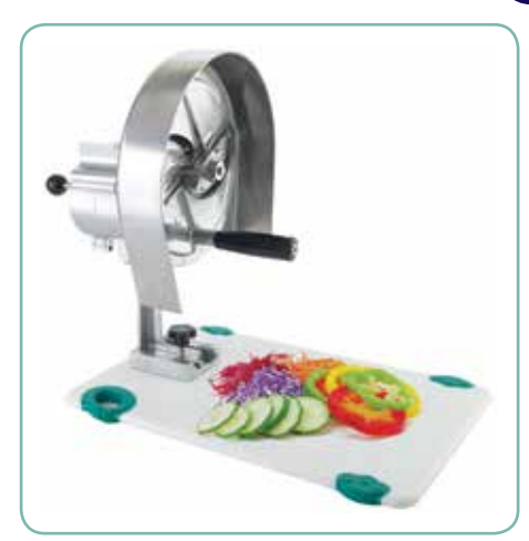
FVS-1 & CBM-1218