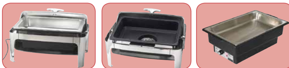
Holds full-size steam table pan and fits in standard full-size chafers