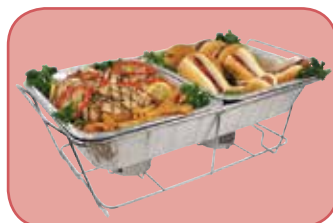
C-2F shown with trays