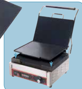
EPG-RF1C easily installs on EPG-1C