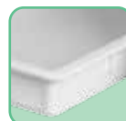
Reinforced edges & corners