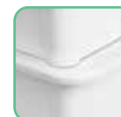
Seamless fit for fresh storage