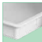
Reinforced edges & corners