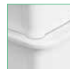
Seamless fit for fresh storage