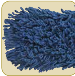
Looped-ends prevent unraveling