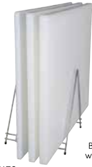
Boards shown with CB-6L rack