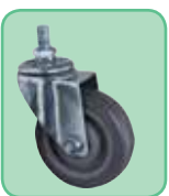
SRK-CT 4" caster