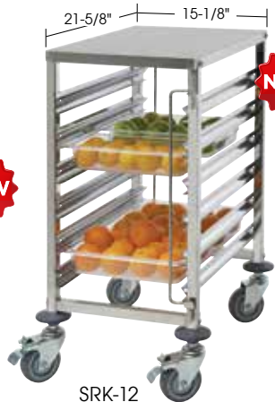
SRK-12 Fits a combination of full, half or third-size pans

NEW SIZES 12-TIER CAPACITY UP TO 1,000 LBS