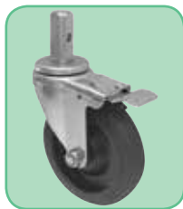
ALRC-5STK 5" caster with brake