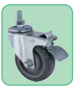
SRK-CTB 4" caster with brake