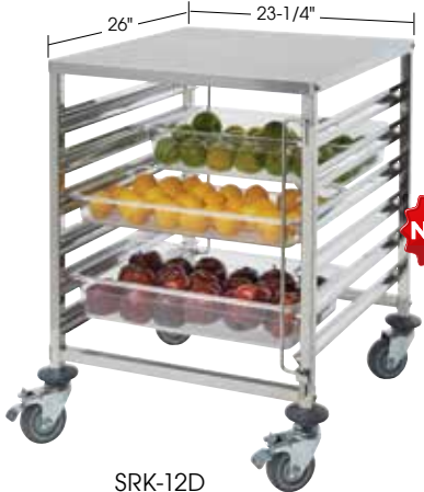
SRK-12D Fits full length pans only, two per tier