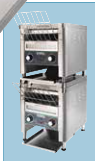
2 vertically stacked conveyor toaster units