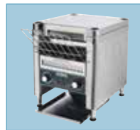
Stacking kit shown on conveyor toaster