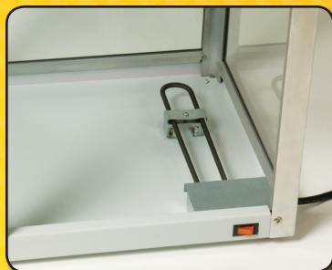
50 watt heating element