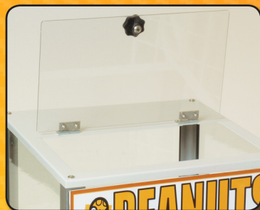
Top-loading for convenience