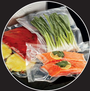
Package Fresh Meats, Soups, Marinades and Stews