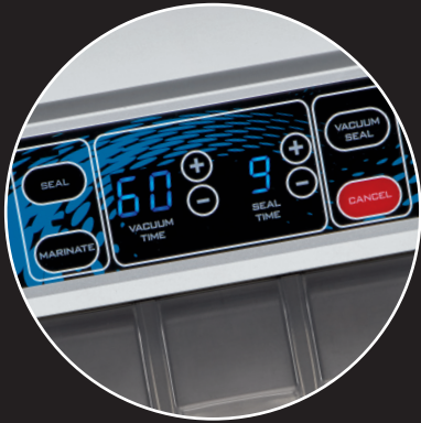
User-friendly, Easy-to-clean Touchpad Controls