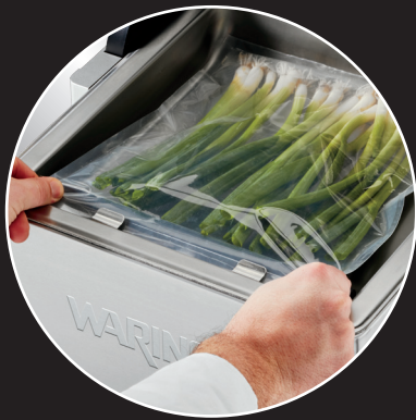
11" Seal Bar Double-seals Pouch