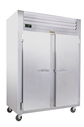
Model Shown Two Section