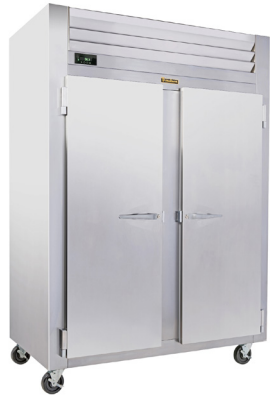
Model Shown Two Section (shown with optional casters)