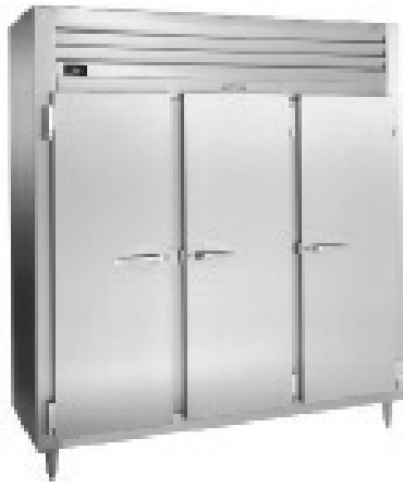
Model Shown Three Section