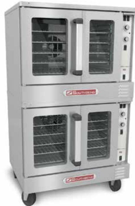
(SLGS/22SC shown with optional casters)