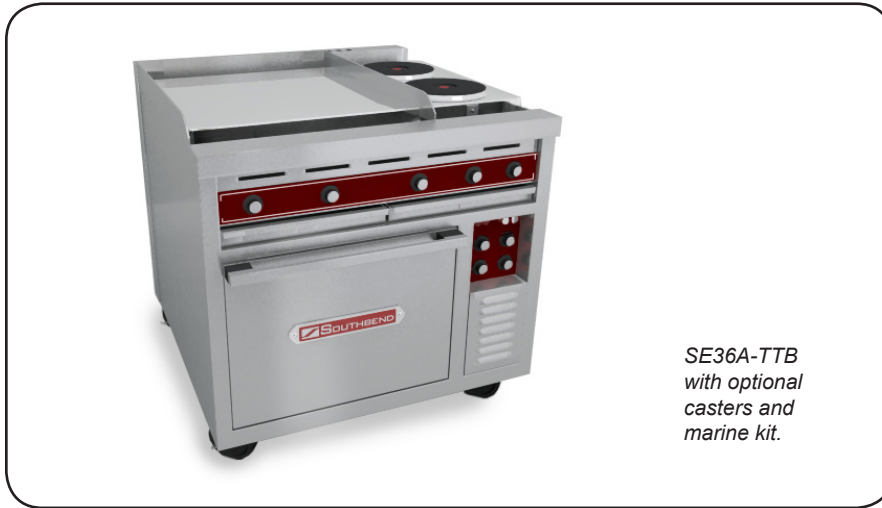
SE36A-TTB with optional casters and marine kit.