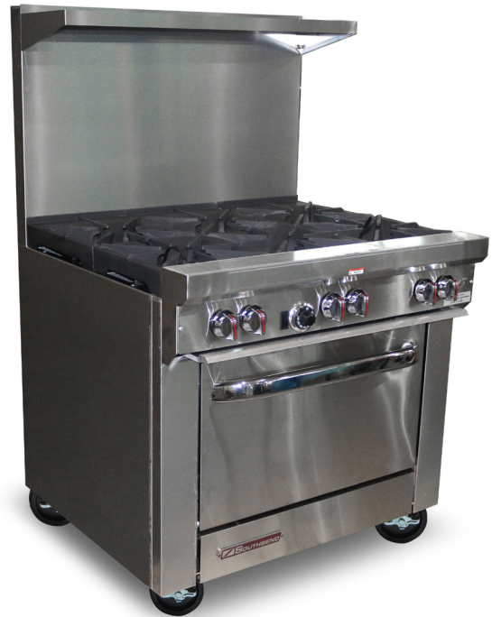
(S36D shown with optional casters)