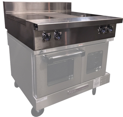
Model shown P36T-ISI

For use with induction safe cookware ONLY. Look for the induction ready logo below.