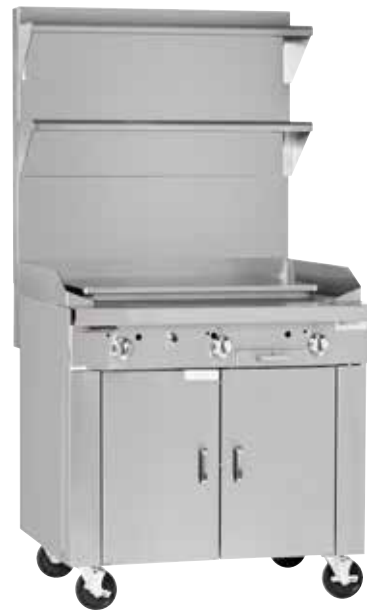
P36C-PPP with optional casters and flue riser.

Plancha units have a raised griddle plate for easy cleaning of cooking surface between loads. 3" wide collection on sides allow separation of waste for preparation of next fare. Plancha griddle is 1/2" thick reinforced steel plate powered by cast iron burners provides fast preheat and recovery time. High heat zone with max temperatures of 800°F located on front 2/3 of plate for quick sear with decreased temps on rear 1/3 of plate for product finishing.