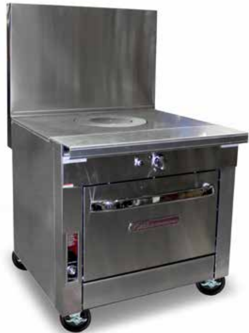
Model P36A-GRAD with optional 24" flue riser