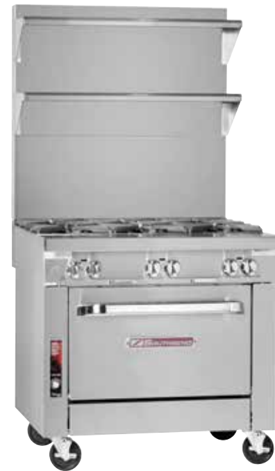
P36D-BBB w/ optional casters and flue riser.