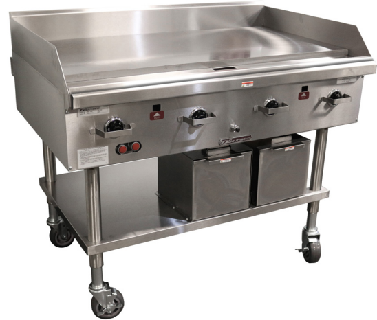
Model shown HDG-48V