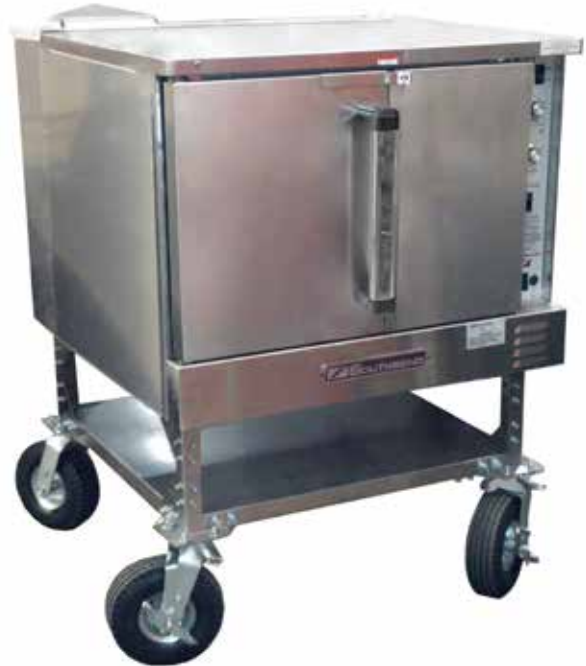
BGS/12SCAT All Terrain