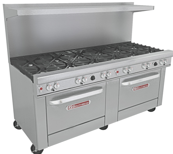
(4721DD shown with optional casters)