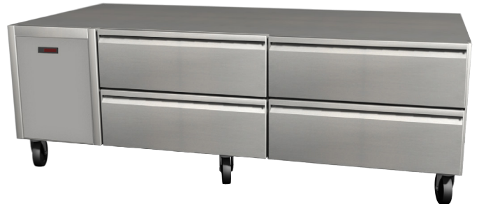
(Model 20072RSB with optional casters)

20032RSB (32" wide); 20036RSB (36" wide); 20048RSB (48" wide); 20060RSB (60" wide); 20064RSB (64" wide); 20072RSB (72" wide); 20084RSB (84" wide); 20096RSB (96" wide); 20108RSB (108" wide)