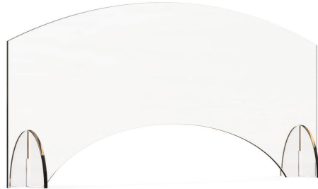
Avant Garde™ Acrylic Sneeze Guard with Pass-Through Window*