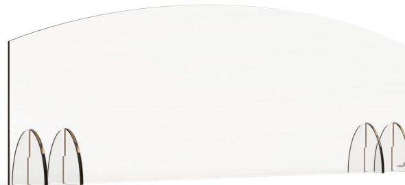
Avant Garde™ Acrylic Sneeze Guard*