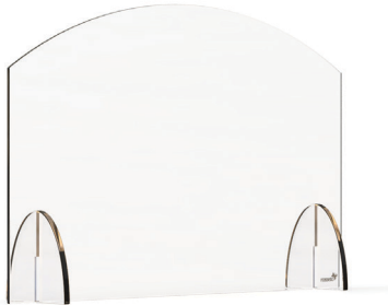
Avant Garde™ Acrylic Sneeze Guard*