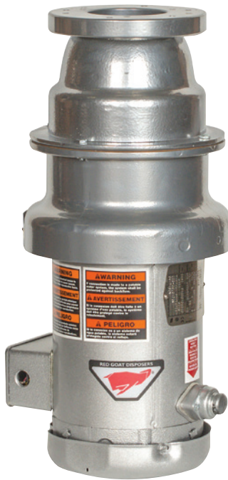
"F" Series Basic Disposer