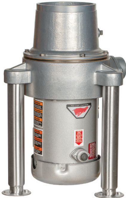
"A" Series Regular Design 7" Throat Size (Shown) Also available with: 4.5" Throat Size or Offset Design with 7" Throat