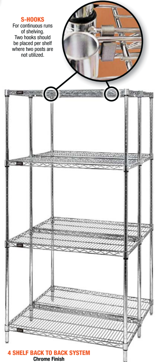
4 SHELF BACK TO BACK SYSTEM Chrome Finish