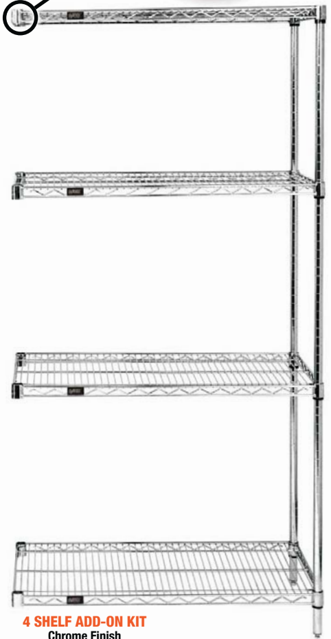
4 SHELF ADD-ON KIT Chrome Finish