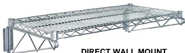
DIRECT WALL MOUNT CANTILEVER