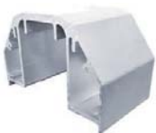
TRACK WITHOUT END PLATE