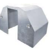
TRACK WITH END PLATE